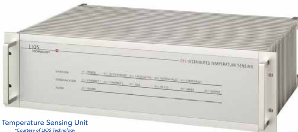
Temperature Sensing Unit

The Distributed Temperature Sensing (DTS) System uses a communications grade fiber optic cable as a continuous linear sensor with a low power laser source to provide real time, multi-point temperature monitoring. The ability to continuously monitor temperature over an extended distance can: