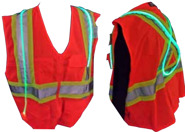
Personal Active Visibility