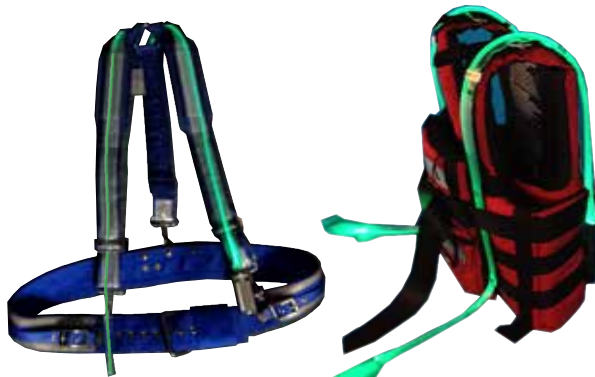
Personal Active Visibility Suspenders